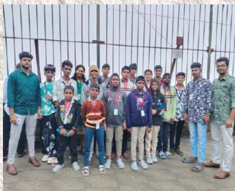
CHILDREN VISIT TO KODAIKANAL & MAHABALIPURAM