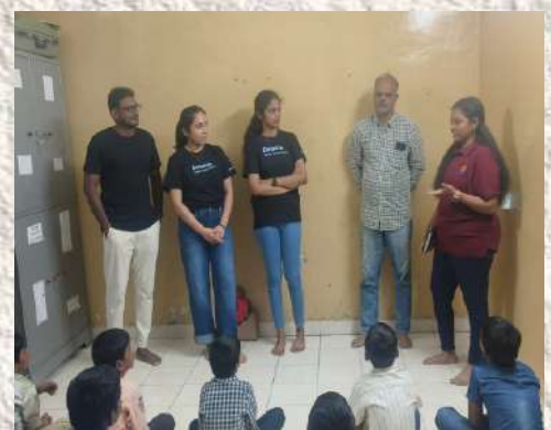
CHILDREN VISIT TO MANTHOPPU