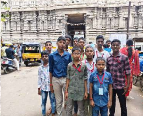
CHILDREN VISIT TO THIRUVANNAMALAI