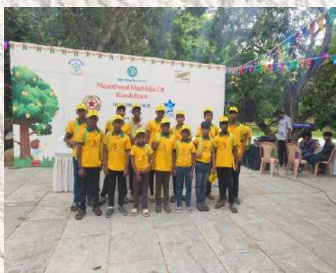
IMPACT DAY By DONORS