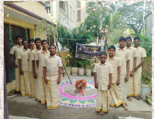
CHILDREN CELEBRATING PONGAL FESTIVAL